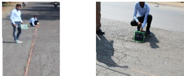
Fig. 1 : Images of onsite detection of cracks

Average cracks in all the roads are shown in figure 2